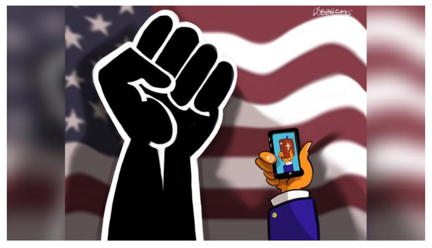
Illustration: Fric Lobbecke

With America's cities descending into lawlessness, it would be easy to conclude that the country is on the verge of collapse. In reality, the problems gripping the US are both more enduring and less apocalyptic than that impression suggests.